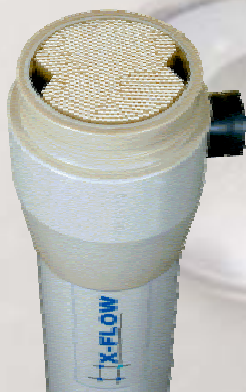
Picture shows vertical arrangement of membrane elements